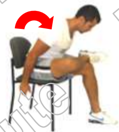
GLUTES & ABDUCTORS