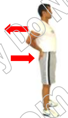
SHOULDERS & CHEST