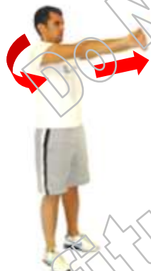
SHOULDERS & UPPER BACK