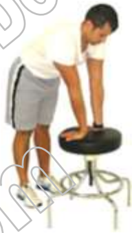
BICEPS & FOREARMS