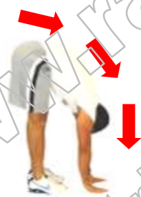
HAMSTRINGS & LOW BACK