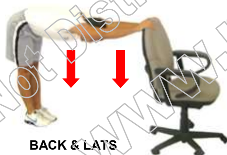
BACK & LATS