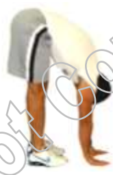
HAMSTRINGS & LOW BACK