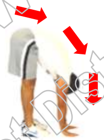
HAMSTRINGS & LOW BACK