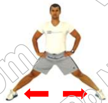
GROIN & ADDUCTORS

• Hold each stretch for 15-30 sec • Stretch slowly • Stop if you feel pain