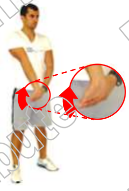
BICEPS & FOREARMS