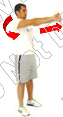
SHOULDERS & UPPER BACK