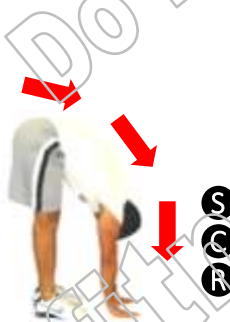
LOW BACK, HIPS & HAMSTRINGS