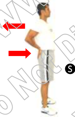
SHOULDERS & CHEST