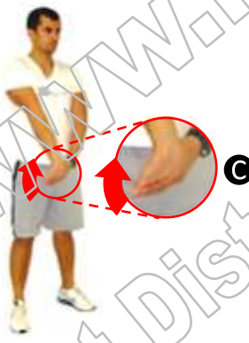
BICEPS & FOREARMS