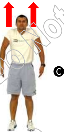
NECK & UPPER BACK