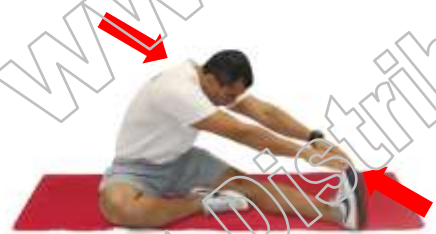
HAMSTRINGS & LOW BACK