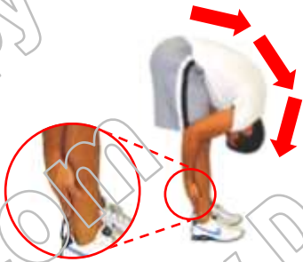
HAMSTRINGS & LOW BACK