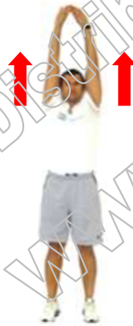
LATS / FULL BODY