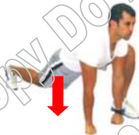
GROIN & HIP FLEXORS