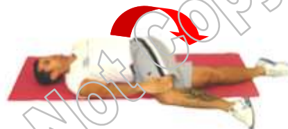
GLUTES & ABDUCTORS