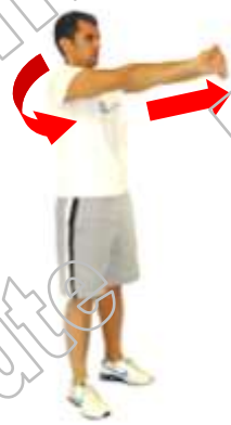
SHOULDERS & UPPER BACK