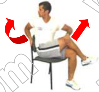
GLUTES & ABDUCTORS