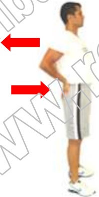
SHOULDERS & CHEST