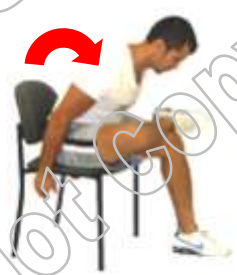
GLUTES & ABDUCTORS