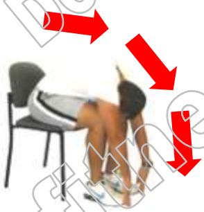
HAMSTRINGS, HIPS & LOW BACK