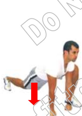
GROIN & HIP FLEXORS