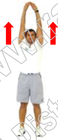
LATS / FULL BODY