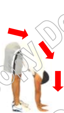
HAMSTRINGS & LOW BACK