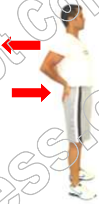
SHOULDERS & CHEST