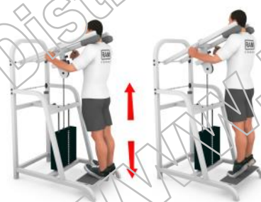
Calf Raise Machine